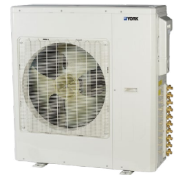
208/230V 18K-42K BTU/h INVERTER-DRIVEN HEAT PUMP SYSTEMS